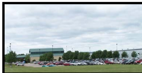
Cabela's - the County's largest employer

Table 7.06 identifies the companies in the county employing the most people by range. Cabela's is the largest employer in the county followed by 3M. The recent economic downturn has led to several businesses laying off or eliminating jobs. Miniature Precision Components and Dillman Equipment Inc. have each downsized and the number of actual employees may be less than listed.