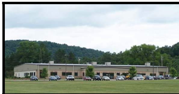
Business located in the Gays Mills Business Park

Strengths And Weaknesses For Fostering Economic Growth: Table 7.11 is a listing of strengths and weaknesses relating to fostering economic development in the county.